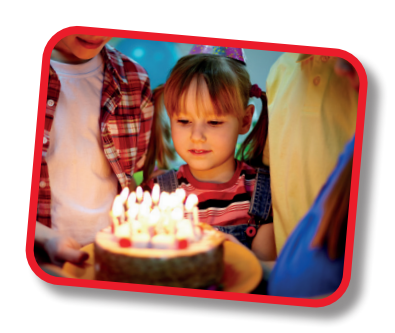
*Please note all prices exclude food.